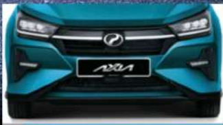
CHROME FRONT GRILL WITH FRONT SKIRT