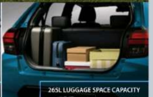
265L LUGGAGE SPACE CAPACITY

Specifications are based on AV variant only