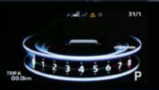
7" TFT MULTI INFO DISPLAY