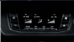
DIGITAL AIR CONDITIONER CONTROLLER