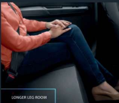
LONGER LEG ROOM