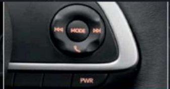
SWITCH CONTROL AND POWER MODE DRIVE