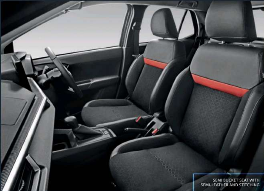
SEMI BUCKET SEAT WITH SEMI-LEATHER AND STITCHING