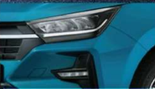
LED HEADLAMPS AND DAYTIME RUNNING LIGHTS