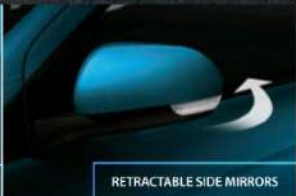
RETRACTABLE SIDE MIRRORS