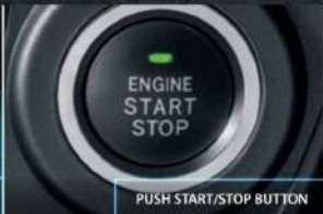
PUSH START/STOP BUTTON