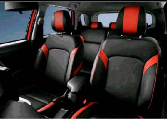
Spacious Interior for comfortable ride

Ergonomically designed to accommodate diverse requirements and needs.