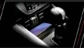
Open Tray with Illumination