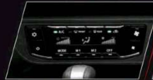
Digital air conditioner controller with quick OFF button