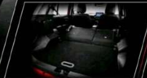
Full-flat Mode Rear Seats