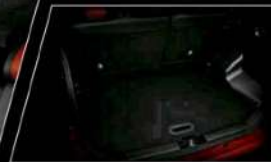
Tier 1: 303 litres