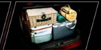
Tier 2: 369 litres