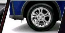
16-inch Alloy Wheels (5-spoke)