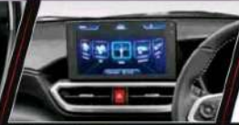
9" Display with sleek user interface