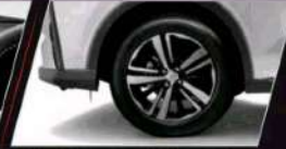
17-inch Alloy Wheels (5-spoke)