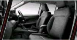
Semi-bucket Fabric Seats