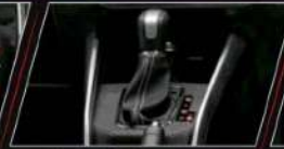
Gear Knob with Chrome