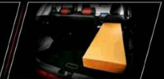
60:40 Split-folding Rear Seats