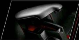
Console Box with Padded Armrest*