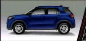
Differences from X