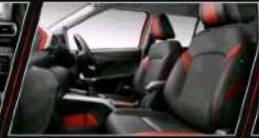
Semi-bucket Leather Seats