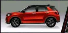
Differences from H