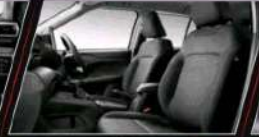
Semi-bucket Fabric Seats