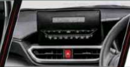
11" Radio with Bluetooth & MP3