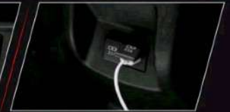
Rear USB ports*