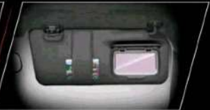
Vanity Mirror with Card Slot