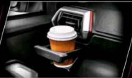
Built-in Cup Holder