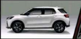
Differences from X