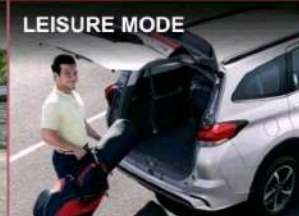
Load it up and pack it in.