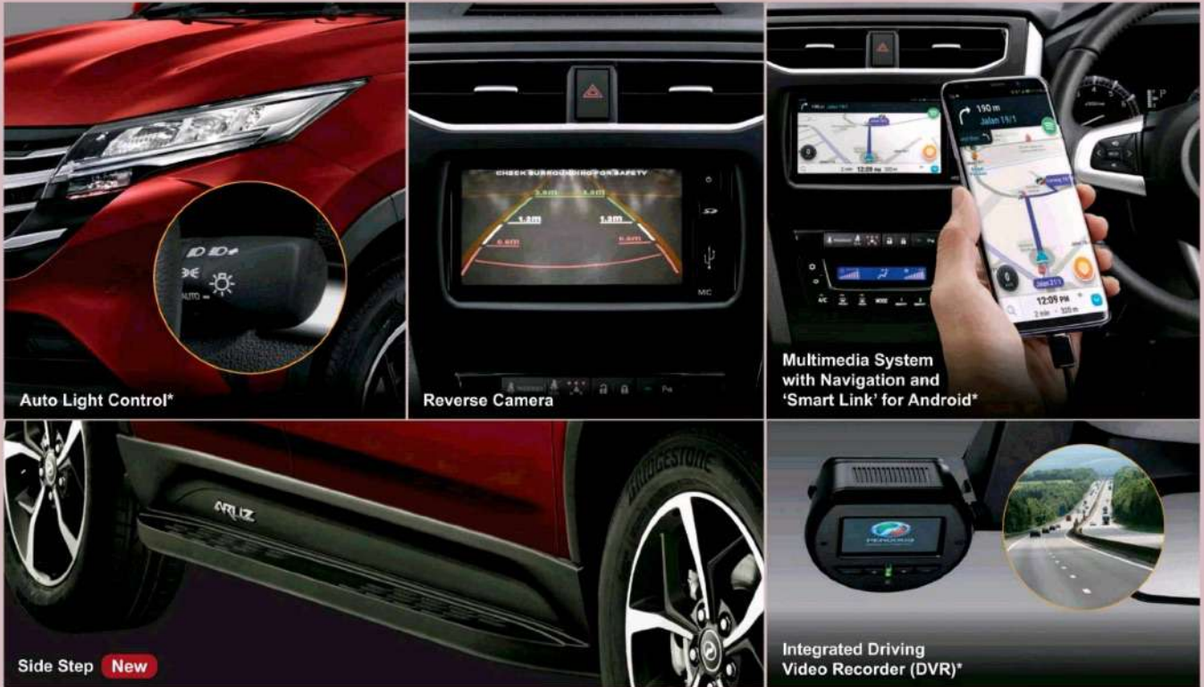
Auto Light Control*