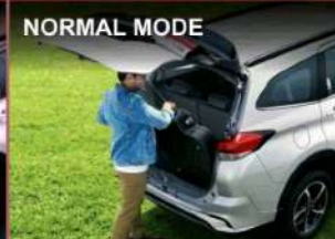
More room for more stuff.