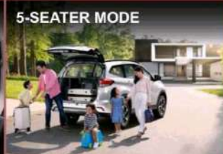
Road trips are always better with your loved ones.