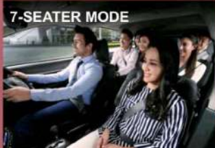
When you just need 2 more.