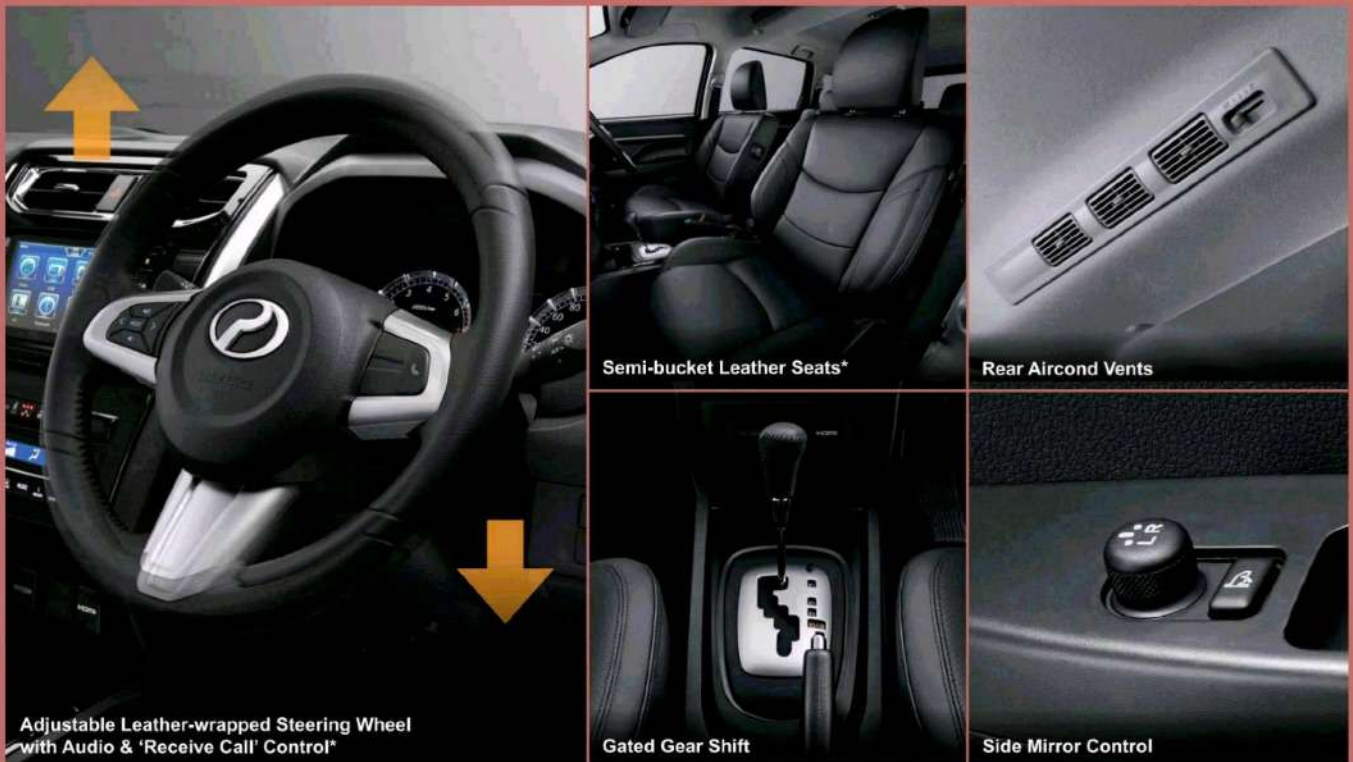
Adjustable Leather-wrapped Steering Wheel with Audio & 'Receive Call' Control*