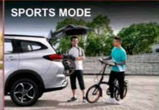
Pack it all in for weekend adventures.